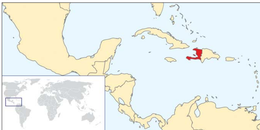
Haiti and its neighbours Map