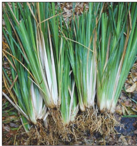
Vetiver plants

Environmental Risks & Benefits: Because of the plant's exceptionally deep roots, vetiver grass is used as a tool for erosion control and water purification in many areas of the world (including Haiti). When harvested for oil production, however, the deep-penetrating vetiver roots can strip all vegetative cover from the soil and cause debilitating soil erosion. In Haiti, when appropriate harvesting and re-planting practices are used, the vetiver root crop can reportedly be cultivated and harvested sustainably. Farmers can and do take preventive measures to counter soil depletion. However, when farmers are under severe economic pressure, premature harvesting and lack of resources for re-planting can lead to environmentally damaging practices. A 2011 report, Vetiver in Southwest Haiti , prepared by Scott Freeman and published by the United Nations Environment Programme (UNEP), describes the pressures faced by Haiti's vetiver farmers: