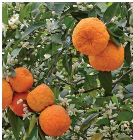
Bitter oranges

Botanical name: Citrus aurantium , family: Rutaceae ; French: orange amère or orange bigarade ; Creole: pye zoranj sure ; also known as Seville orange and sour orange.