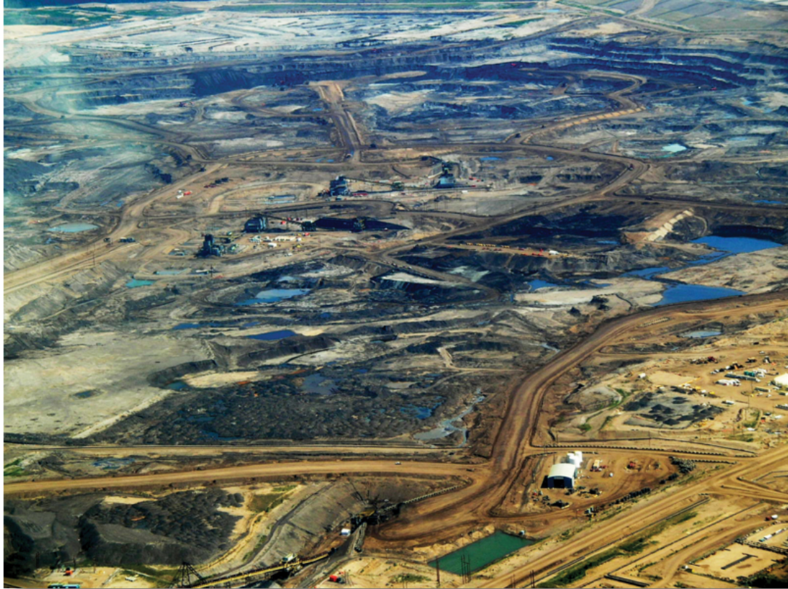
"Tar sands, Alberta (2008)", by Dru Oja Jay, Dominion, is licensed under CC BY 2.0 ( https://creativecommons.org/licenses/by/2.0/ ).

which CN is one of two major operators) have become an alternative oil pipeline, shipping over 400,000 barrels per day in January 2020 3 . For comparison purposes, the Trans-Mountain Pipeline that Canada's government is attempting to expand currently has a capacity of 300,000 barrels per day.