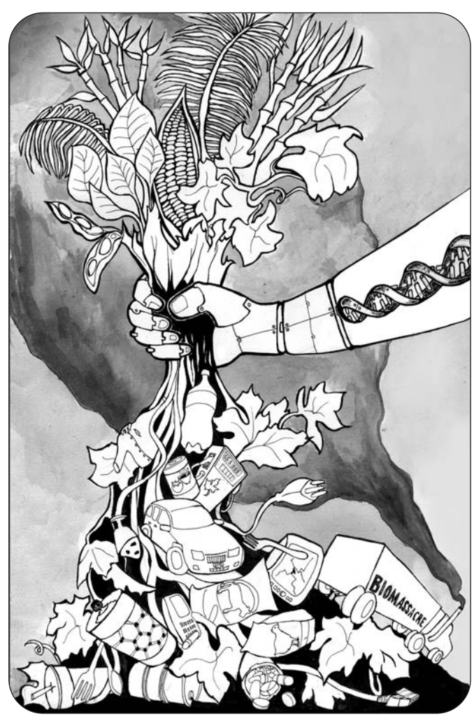
"Biomassacre" illustration by the Beehive Design Collective

At COP 11, government negotiators will be asked to consider bringing a new and emerging area of industrial activity under the oversight of the Convention on Biological Diversity. Synthetic Biology is a burgeoning technological field that builds artificial genetic systems and programmes lifeforms for industrial use. It urgently requires effective governance.