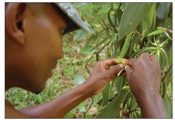
A farmer in Tanzania pollinates vanilla flowers. Vanillin is just one of many high-value natural products that the synthetic biology industry is working to synthesize artificially in a vat, potentially impacting rural livelihoods.

While the Nagoya Protocol put in place rules for the physical transfer of genetic material, synthetic biologists routinely transfer genetic material digitally (as genetic code).